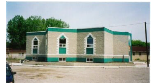
The shell of the Masjid as it stands today